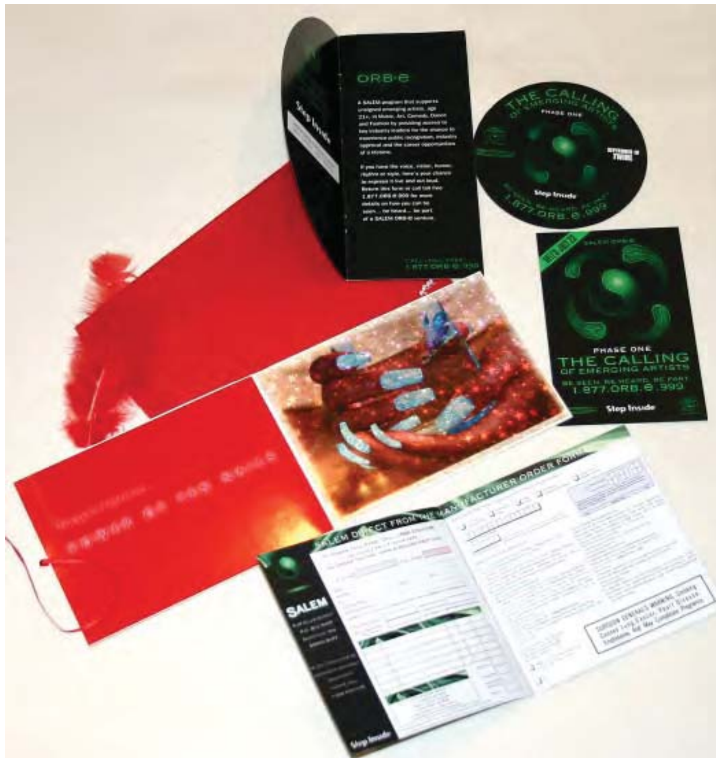
Sales Marketing, Promotional Design- concept to finished print production. For Kiss Cosmetic & Marketing Corp of America.