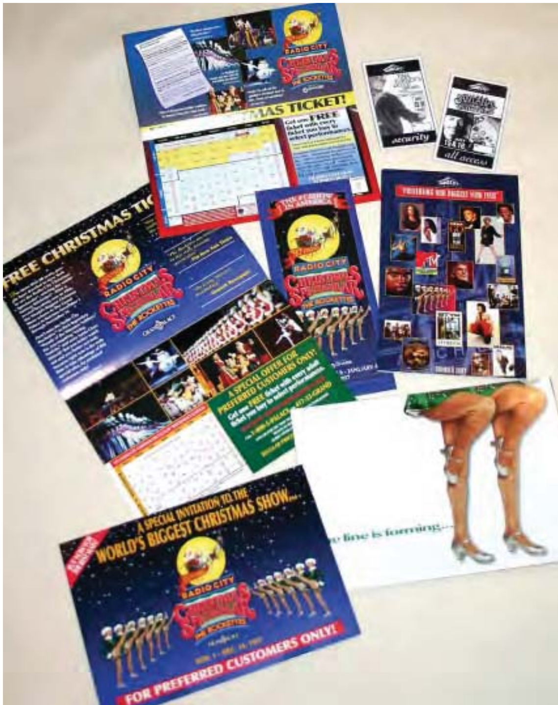
Direct mail, Sales Marketing, Promotional Design-concept to finished print production. For Radio City Music Hall- Event brochure, Direct mail, Promo Poster